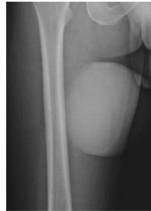
Fig. 1 AP radiograph of the right thigh

Twenty-seven year-old male presents with a 6 month history of a painful right thigh mass with rapid enlargement and new onset of bleeding (Figs. 1, 2, 3 and 4)