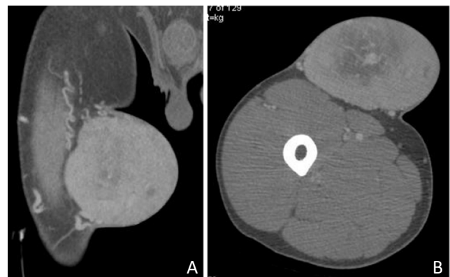
Fig. 2 (a) Coronal and (b) axial contrast-enhanced CT of the right thigh

The diagnosis can be found at doi: 10.1007/s00256-015-2113-9