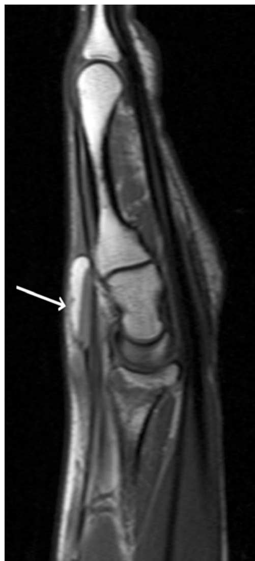
Fig. 2 Sagittal T1-weighted MRI 4 days after injury

The diagnosis can be found at doi: 10.1007/s00256-012-1570-7