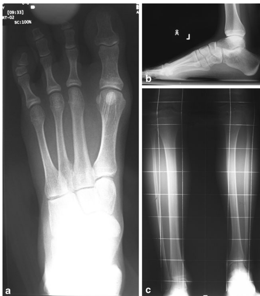
Fig. 2 X-ray of left foot hypoplasia with intermediate ray deficiency (a, b, c)

foot rays; this, however, does not allow determination of which ray is absent: the lateral or intermediate one.