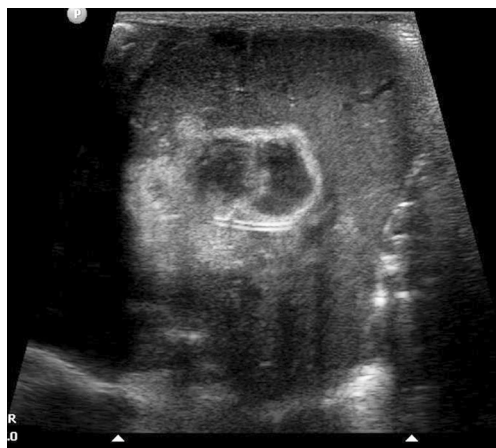
Fig. 6 US of the liver on day 14 of life in a 29-week gestational age 1.22-kg newborn. A 5.1×3.0×3.4-cm hypoechoic lesion with a hyperechoic rim replaces most of the right hepatic lobe. A UVC is noted crossing the collection