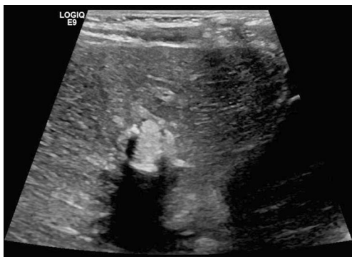
Fig. 4 A follow-up US in a previously 34-week gestational age, 3.42-kg infant who underwent a US-guided aspiration of hepatic collection 9 months after the procedure shows a resolving lesion with residual dystrophic calcifications

A UVC was introduced into a 38-week gestational age, 4.69 kg newborn on day 1 of life. The tip of the UVC was placed to the right of the vertebral column at the level of T9, at the level of the diaphragm as confirmed by plain abdominal radiograph. The child was started on parenteral nutrition and antibiotics. On the 9th day of parenteral nutrition, the patient developed abdominal distension. Laboratory findings revealed elevated liver enzymes, in addition to abnormal coagulation factors and leukocytosis. The UVC was removed and a PICC was placed. Liver US at that time demonstrated large heterogeneous complex collection measuring 8.9 \times 8.4 \times 5.4 cm involving the right lobe of the liver and displacing the left lobe (Fig. 5). The newborn then underwent an US-guided hepatic collection aspiration due to the large size of the lesion (Fig. 5). Twelve days after hepatic collections aspiration, follow-up US revealed an interval decrease in the size of the complex fluid collection. The patient completed a total of