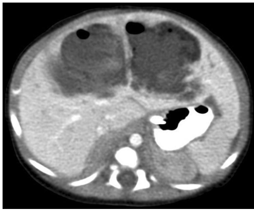
Fig. 3 CT scan of the abdomen on day 7 of life in a 34-week gestational age, 3.42-kg newborn demonstrates a large 8.3-cm complex air-containing fluid collection in the left and right lobe

abnormal accumulation of fluid in the right and left hepatic lobes (Fig. 4).