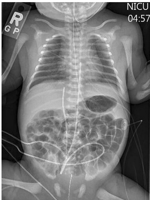
Fig. 1 AP abdominal radiograph of 35-week gestational age, 2.47-kg infant on day 0 of life shows the tip of the catheter to the right of the vertebral column at the level of the T10 vertebra

A UVC was introduced into a newborn on day 1 of life, who was born at gestational age of 35 weeks, with a birth weight of 2.47 kg. The tip of the catheter was placed to the right of the vertebral column, at the level of T10 vertebra, below the level of the diaphragm (Fig. 1). Parenteral nutrition was initiated through the UVC. On day 7 of life, the patient developed abdominal compartment syndrome and hemodynamic instability. Laboratory findings revealed leukocytosis, thrombocytopenia and mildly elevated liver function tests. The UVC was removed and a peripherally inserted central catheter (PICC) was placed. Ultrasonography at that time revealed complex cystic mass in the liver and large amount of ascites (Fig. 2). On day 9 of life, the patient underwent emergent exploratory laparotomy, an abdominal silo was placed and a left