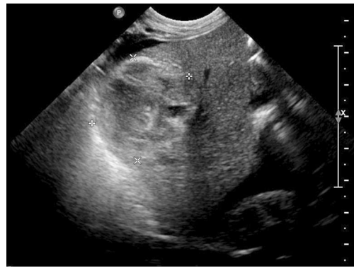
Fig. 2 Liver US of a 35-week gestational age newborn, with 2.47-kg birth weight on day 7 of life shows a complex cystic mass/collection within the liver along with a significant amount of ascites

subcapsular liver hematoma was controlled. A large amount of ascites was removed for laboratory studies, which revealed triglycerides, proteins and glucose, consistent with infusion of parenteral nutrition into the liver, rupturing the liver capsule and leaking into the peritoneum. Three days later, the surgical wound was closed by secondary intention. On day 14 of life, repeat liver function tests returned to normal. Eventually the patient was advanced to full enteral feeds without difficulties. No follow-up study has been performed since the writing of this case series.