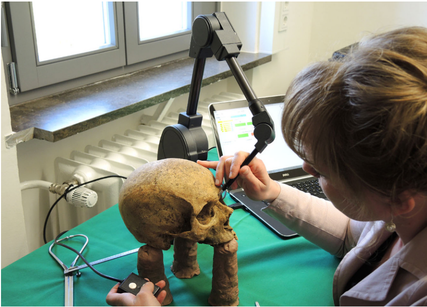
Fig. 3 ▲ Measuring process with the 3D digitizer