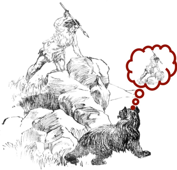
Fig. 1 Modelling the world. Figures 1, 2, 3, and 4 from McIntyre (1923), The cave boy of the age of stone