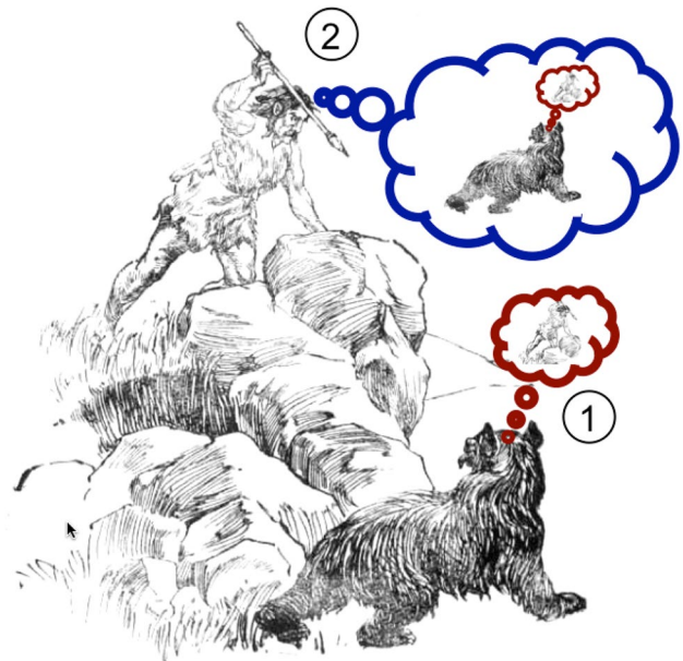
Fig. 2 Predicting other animals reactions. Figures 1, 2, and 3 from McIntyre (1923), The cave boy of the age of stone

round, bringing the flock back towards the fold. This sending round is one of the hardest things to teach, but the wonder is that it can be taught at all. One would imagine that the natural reaction of a predator in the wild, when it sees the flock of potential prey, would be to head straight for them. However, if the flock scatters, it is harder to catch any one of them. Successful wolf packs work as a team, some wolves circle round, and some come more stealthily in.