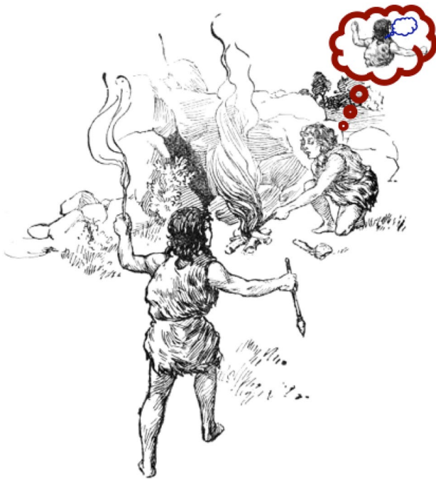
Fig. 3 Simple predictions about other humans—first-order theory of mind

hominids have well-developed proto-theory of mind as described above.