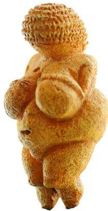
Fig. 5 Venus of Willendorf, c. 24,000–22,000 BCE

“You have searched me, Lord, and you know me. ... you perceive my thoughts from afar” (Psalm 139); just a short step to an internalised ‘ought’. An AI or robot becomes an ethical agent, not so much when others perceive it as such, but when it perceives that others perceive it so.