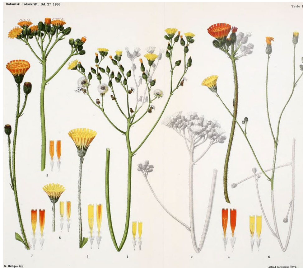
Fig. 1 A figure reproduced from Ostenfeld and Rosenberg (1906) illustrating the parents used and the progeny derived from their hybridization experiments with Hieracium . 1 and 2: Hieracium excel-lens , 3: H. pilosella , 4: H. aurantiacum , 5: H. excellens × aurantiacum , 6: H. excellens × pilosella , 7: H. pilosella × aurantiacum ,

8: H. pilosella . (Ostenfeld and Rosenberg (1906) Experimental and cytological studies in the Hieracia. I. Castration and hybridization experiments with some species of Hieracia. Botanisk Tidsskrift 27:225–248)