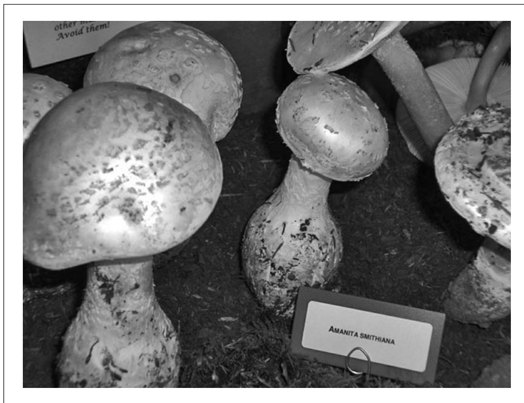
Figure 3: Amanita smithiana .

from his renal function and a single LDH noted to be elevated, no other lab abnormalities appeared. He continued to generate urine while an inpatient. He was discharged from the hospital 10 days postingestion on outpatient dialysis. The patient continued to have thrice-weekly outpatient dialysis. He was started on amlodipine 10 mg daily for hypertension secondary to the renal failure. Thirty-nine days postingestion his BUN was 26 mg/dL (0.92 mmol/L), his creatinine was 1.4 mg/dL (123.8 \mu mol/L), and dialysis was discontinued.