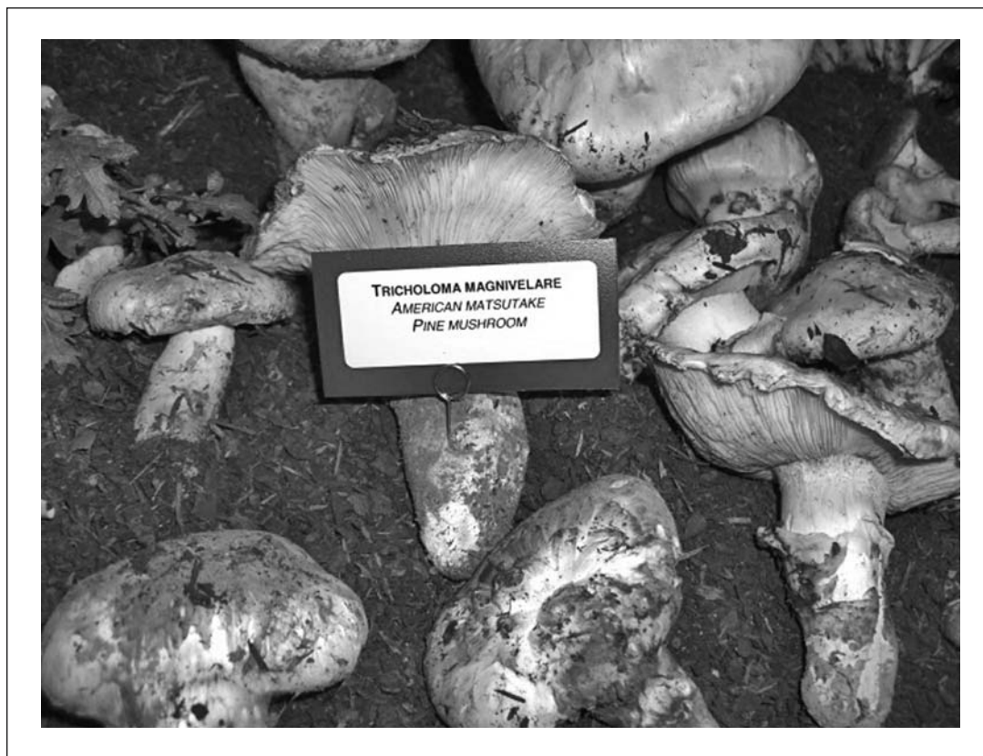
Figure 4: Tricholoma magnivelare .

timing of the increasing ingestion frequency that has been observed [8]. Today they typically sell for $30 per 1/4 lb and are used extensively in Japanese cooking. Since these mushrooms grow in a limited geographic range, they are frequently harvested and exported to other regions for culinary purposes [9]. Since these mushrooms have a high potential for mistaken identity and may be transported to a region with an unregulated food market, this pattern of toxicity is important to recognize as it may occur anywhere these mushrooms may be shipped. Given the large profit margin and the increased visibility of the mushroom, it is understandable that ingestions of toxic look-alike mushrooms have occurred. Cases of similar delayed onset renal failure have been described with other mushrooms, including A pseudoporphyria and A abrupta [10].