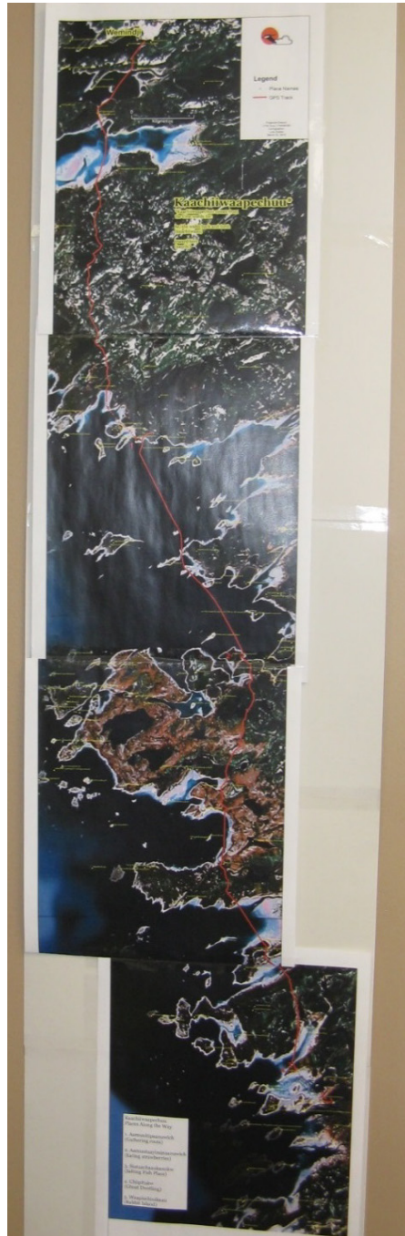
Fig. 2. Google Earth with kaachewaapechuu GPS line (Community Centre, Wemindji)