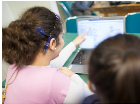
Fig. 2. Children worked collaboratively and communicate with the assistance of the visual programming language

Throughout the workshop, children worked in dyads and developed in total six interactive projects. Children worked collaboratively with the assistance of the visual programming language (see figure 2); record of children's activities was kept through photographs, videos, observation-reports and surveys from the experts; this information was used to evaluate the workshop and as an input experience for the next phase of the study.