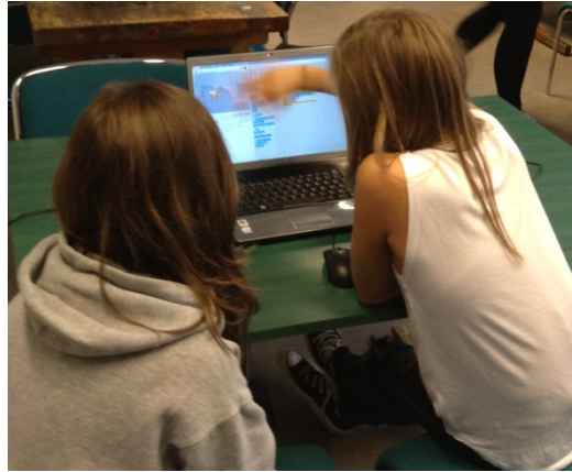
Fig. 4. Child-Programming Environment Interaction with the assistance of the camera