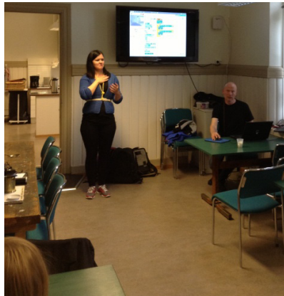
Fig. 1. The context of the game coding workshop

Twelve 12-year old children with DHH from the Deaf school of Trondheim in Norway participated in the game coding workshop. The workshop took part in the Norwegian Deaf Museum (see figure 1, for the context of the workshop). The schedule, the infrastructures and the main goal of the workshop were based from knowledge we obtained from prior similar experience [5] [6].