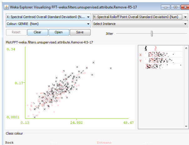
Fig. 3. Visualizing Centroid and Rolloff for genres Rock and Entexno