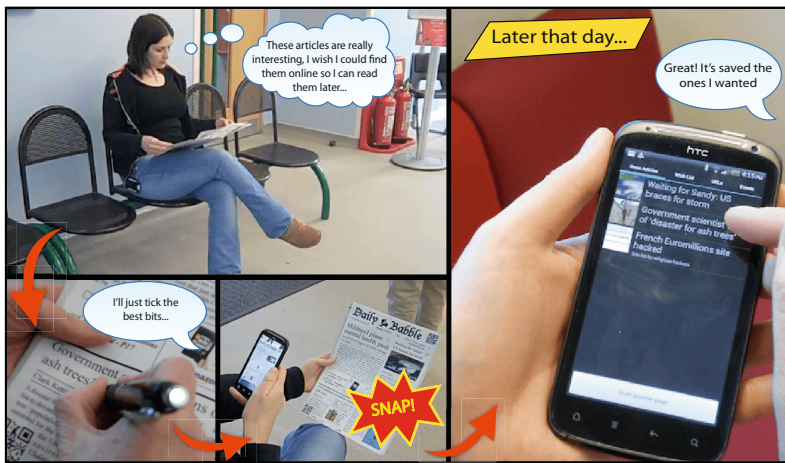
Fig. 1. Using TicQR to interact with a newspaper. Left: reading a newspaper, finding and then ticking interesting content. Right: browsing saved items at a later time.

The TicQR design aims to bridge the physical-digital document gap in a manner that is minimally intrusive to the user. The system allows people to read a paper document, mark which parts they are interested in, and archive them digitally by taking a single photograph using a standard smartphone handset (see Fig. 1). This approach allows multiple ‘clippings’ on a page to be recognised and interpreted simultaneously, then presented to the user for browsing or later use. We envisage many scenarios where TicQR could be useful, some of which are illustrated later in Fig. 2.