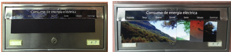
Fig. 3. Mailbox of one participant in the beginning (left) and in the end of the study (right)

In the other two families (from a different block), the task was performed by the father, (House 3) and the mother (House 4). The positioning of the mailboxes meant that it was almost impossible for neighbors to ignore each other's consumption. This was confirmed during the interviews, 2 of them were actually curious to check: “I got surprised in the end, our values were close (comparing with the neighbor), but of course since we are comparing savings the actual consumption values could be different” House 3 Father.