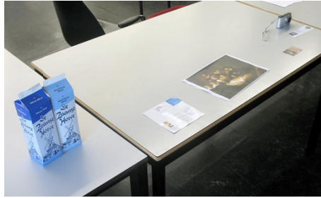
Fig. 1. Props used for the five tasks the participants had to perform

In this sense, an evaluation based on the video prototype is practically identical (as far as the users are concerned) with the situations in which video prototypes are evaluated as part of an actual design process.