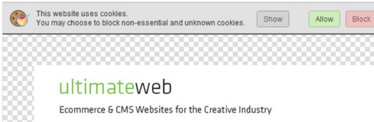
Fig. 1. Cookie dialog control from cookieguard.eu

Fair and unbiased choice design is a tricky problem. Default choices have a dramatic impact on user action [1]. Heuristic and bias reasoning theories account for a number of different situations leading to systematic bias. Biases including loss aversion (e.g., change from status quo), framing, and evaluation of options in relation to reference points (e.g., expectation and social comparison) have been well-described by Tversky and Kahneman [2,3].