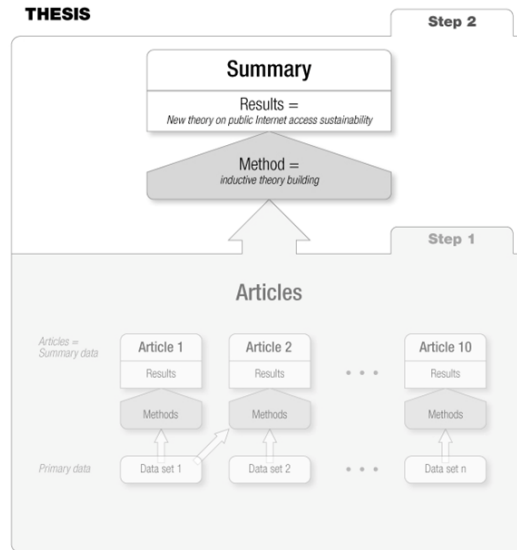
Fig. 1. Thesis structure: The Summary (Kappa) from [18]

use of GTM in IS research [8, 9, 10], and some practically oriented papers [11,12], one central question emerged: “ Is it possible to start the GTM process (coding etc.) from the existing articles, and not from the primary data? ” (see Figure 1).