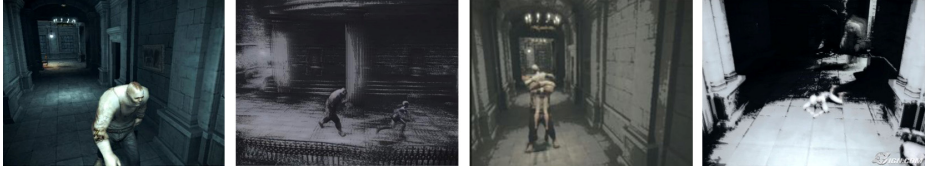
Fig. 5. Visual Contrast during Enemy-Encounter in Haunting Ground