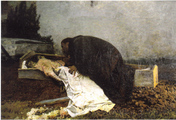
Fig. 1. Hatred by Pietro Pajetta, oil on canvas

Style. The style combines realistic methods with abstracted approaches to underline the topic and to lead the audience's eye to focus on the center of the painting. Even though at first, the painting looks realistically painted, it isn't: The painter carefully focused on the character of the dead woman and added lots of detail to her clothes, especially her white skirt, to make it the most outstanding part of the painting. The second character is almost a mere silhouette, with lack of details. It hovers like an ambiguous shadow over the first character and is nearly as stylized as the nature in the background, which is just implied by its shapes (the trees and the horizon). The level of detail increases with the immediate proximity, while the shapes in the distance appear blurry.