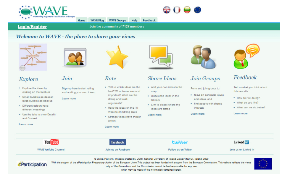
Fig. 1. Platform Home Page (EU pilot)

position, supporting argument, opposing argument, protagonist, etc.) as well as different link types. Adding a new idea involves typing a short description (70 characters maximum) and, if desired, also providing additional details e.g. a larger description (300 characters maximum), text, photos, video (e.g. from YouTube), links etc. Any registered user is able to change any idea on the map. A moderator has been assigned in each map being responsible for editing ideas, deleting irrelevant or offensive contributions, etc.