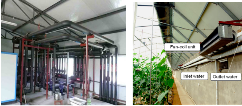
Fig. 1. GSHPs and agricultural greenhouse in test