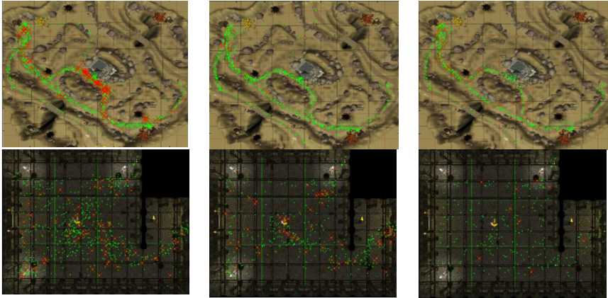
Fig. 2. PvP Combat in center and tower zones on day 3 (right), day 4 (center) and day 5 (right). Dots represent locations, X's represent battles.

The purpose of the second requirement was to provide a sufficient duration of play to facilitate behavior change through scaffolding. While a single week is too short to actually observe scaffold-induced changes, we asked players if the mote and game changed their perception of activity. When asked if “wearing the mote caused me to think about my daily activities more than usual,” players answered in the affirmative (6-A, 2-N). When asked if “having my daily activities impact the daemon settings caused me to think about my daily activities more than usual,” players also answered positively (6-A, 1-N, 1-D). Player comments also indicate that having activity level the animal companion caused them to reflect on their activity, “The daemons provided immediate feedback for actions which I knew were, in the long run, good for me”; “When I was doing exercise, I did think it was cool that my daemon was leveling up”. Overall, our PACE encouraged people to think about their activity levels and make small changes to their behaviours: “given the choice I would opt to (say) walk to the store rather than drive”; “...most lunch hours I'm stationary; with the mote, I decided to use the time to go on walks. On one occasion I didn't bother taking my bus home because of the mote. The resulting walk took nearly two hours.”; “I was more inclined to take stairs instead of an elevator, walk somewhere nearby instead of driving, or to go somewhere a little farther than I usually go to for lunch.”