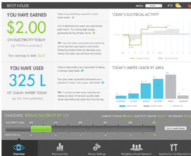
Fig. 2. The Dashboard

Our system comprises three main components: a control backbone that provides fine-grained measurement, device control and automation logic that is based on a