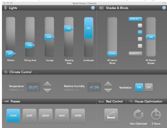
Fig. 5. One view of the ALIS controls interface

information, the Ambient Canvas combines LED lights and filters of various materials to produce light effects on the kitchen backsplash. This subtle feedback on performance and energy efficiency does not require active attention on the part of the resident, and integrates into the home cohesively. In addition, we are currently studying the use of landscape photographs that subtly change according to levels of water consumption. These are meant to serve as both aesthetic elements and informative views. In both these contexts, informative art is intended to promote awareness of resource use to assist and influence sustainable in-the-moment decision-making while respecting aesthetic constraints. We