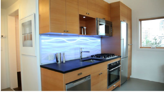
Fig. 4. The Ambient Canvas

We are exploring the use of informative art visualizations in two contexts. The Ambient Canvas is an informative art piece embedded in the kitchen backsplash that provides feedback on the use of electricity, water, and natural gas. As opposed to typical graphical displays that may use numbers or charts to convey