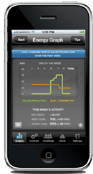
Fig. 6. Mobile

Three touch panels are embedded into the structure of each home. Each display runs a browser in full screen kiosk mode. A large touch panel is placed in a central location: in the kitchen back-splash in North House, and on the wall in the central hallway in West House. Additionally, two smaller panels provide localized control and feedback throughout the home. In North House these are placed at the two entryways. In West House, one is installed in the garage and the other is placed beside the upstairs desk. Access to the full ALIS PC interface is possible at each access point, but complicated by the affordances and form factor of a touch screen. To address this, we have configured the interfaces on the panels to default to information and control views appropriate to their location. For example, the main control panel allows easy access