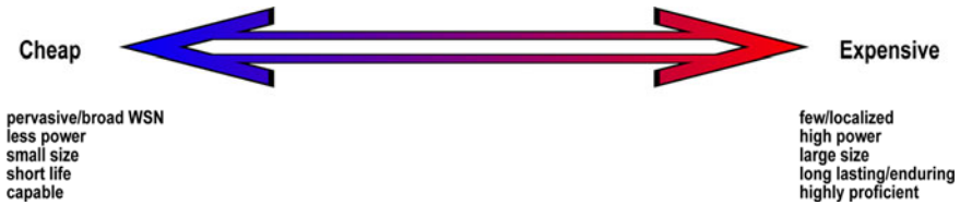
Fig. 1. The cost spectrum for SN systems

Figure 1 illustrates the cost spectrum for SN systems. As the design choice moves between the extremes, the features of either extreme will become more pronounced. A cheap system will allow for a pervasive network of low-cost sensors and gateways to be deployed on a potentially massive scale. Whereas expensive systems (as in the AIMS example [8]) can only result in a few sensor nodes thereby giving localized readings. Low-cost systems potentially have lower power requirements and the components are physically smaller than in an expensive infrastructure. However, cheap systems typically do not have the same endurance and life span as more expensive setups. Although the pace of improvement in technology means that sensors can be outdated within two/three years in any case. In general, cheap sensor nodes can be easily replaced which means their lifespan may not be a significant limiting factor. Furthermore, expensive systems that are damaged, lost or stolen are quite difficult to replace making less expensive systems more attractive. While expensive systems are highly proficient (and precise) due to their sophistication, cheap systems are usually capable albeit with less precision.