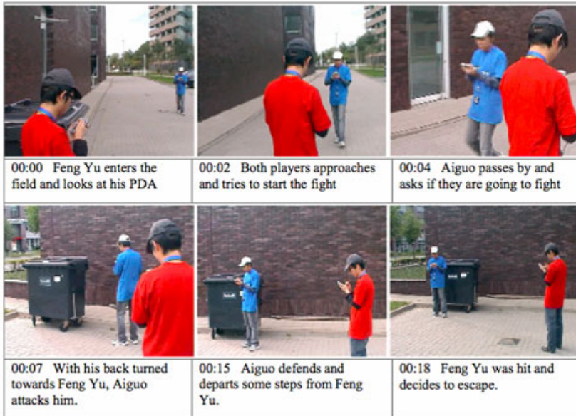
Fig. 2. The Chinese fight

The fight mechanics, a component of the game logic, and of the underlying technology, has been used from both player groups. To conquer a field a player has to move into that field. As soon as an opponent player is within the same field each player has the possibility to decide whether he wants to attack or to flee. To attack the opponent they have to identify their enemy physically and to choose the appropriate virtual symbol of their enemy to start the fight.