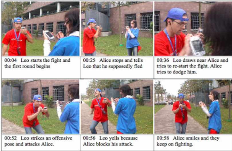
Fig. 3. The German fight

However, the players of both groups fought quite differently. The Chinese players fought in a charily manner, kept physical distance to each other and focused on the virtual level. The German players fought in an offensive, expressive manner. They pestered each other, and focused on both, the virtual and the real level, compare Table 1.