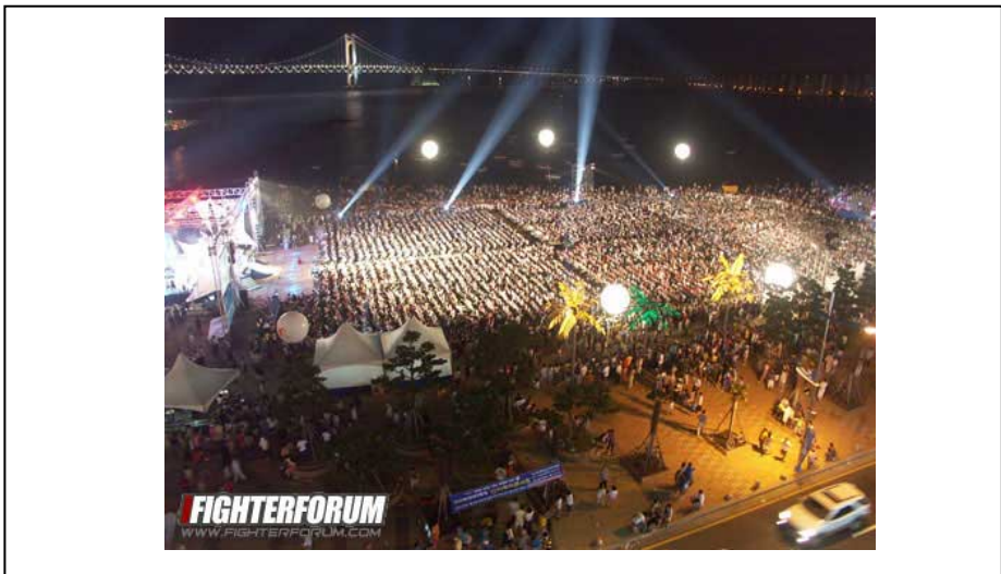
Fig. 4. An e-sports stadium where professional Starcraft games are played

Many publishers now provide players with an engine for generating game content. In the case of Starcraft, the generation engine allowed players to not only create new game maps but it allowed them to modify the fundamental rules of the game. With this new ability, players became level designers and co-authors of the game. Due to