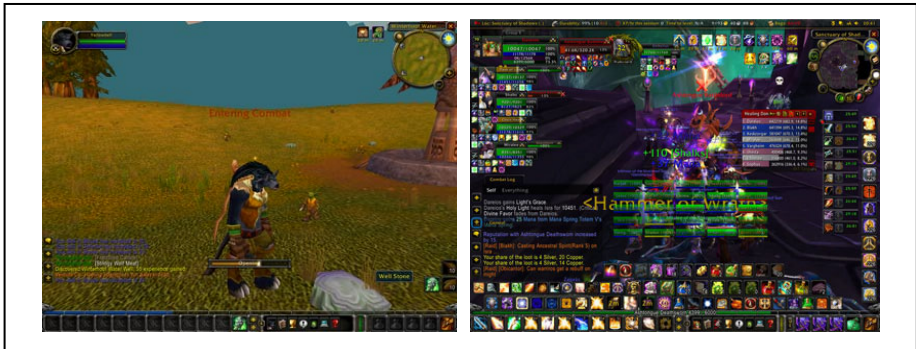
Fig. 6.1. Default WoW UI

While it is possible for users to modify their own user interface, this is a highly complex task and requires some technical knowledge. It has become far more common for player groups to publish their tested modifications for the entire player community to use. This trend has resulted in another change in the game that is somewhat more worrisome. As players progress through the game and reach the upper levels, other players' expectations increasingly include the use of certain modifications. In fact, if a player does not have a minimal set of UI modifications installed they are frequently not allowed to join a group. This can be a serious issue if the formation of a group is necessary to achieve certain required tasks. As teams approach the most exclusive advanced content available only to the highest level players, additional requirements of specific equipment (weapons, armor, exclusive abilities, etc.) are also imposed. This exclusionary behavior closely resembles classism and is a source of frequent frustration for newer players.