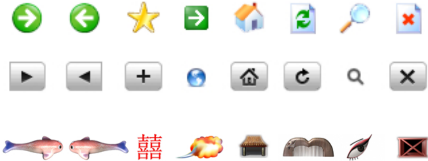
Fig. 3. Selection of IE 7.0, Safari 3.0, and CCD web browser icons

icon functions were selected from each of the latest IE, Safari, and CCD web browsers, i.e. Forward, Backward, My Favourite, Go/Visit, Home, Refresh, Search, and Stop. The order of these when presented to participants was deliberately mixed up to prevent guessing by test subjects.