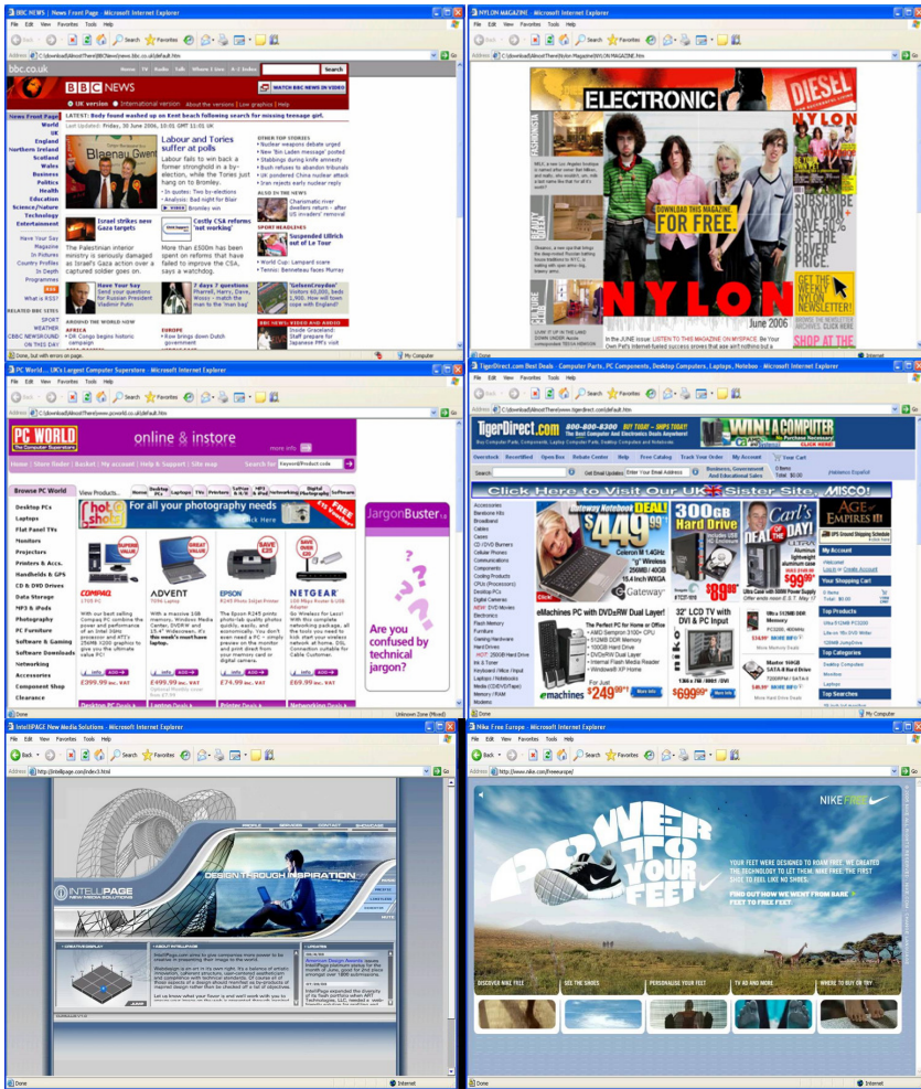
Fig. 1. BBCNews (upper left), Nylon (upper right), PCWorld (middle left), TigerDirect (middle right), IntelliPage (lower left) and Nike (lower right)

The hypotheses were posed to explore associations between users' attention, their perception of interesting design features and content, memory for features and content, and their overall rating for the site. The following sites were selected: