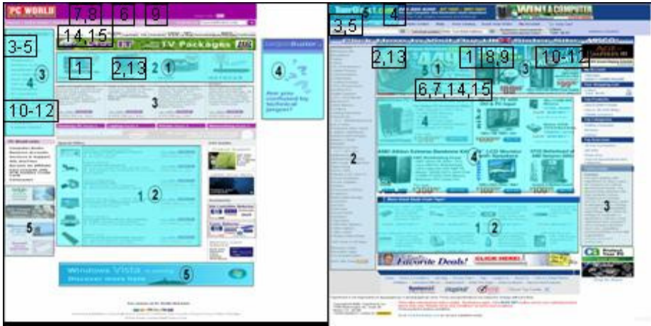
Fig. 3b. User-reported top five areas of interest and top five fixation densities for PCWorld (left) and TigerDirect (right)