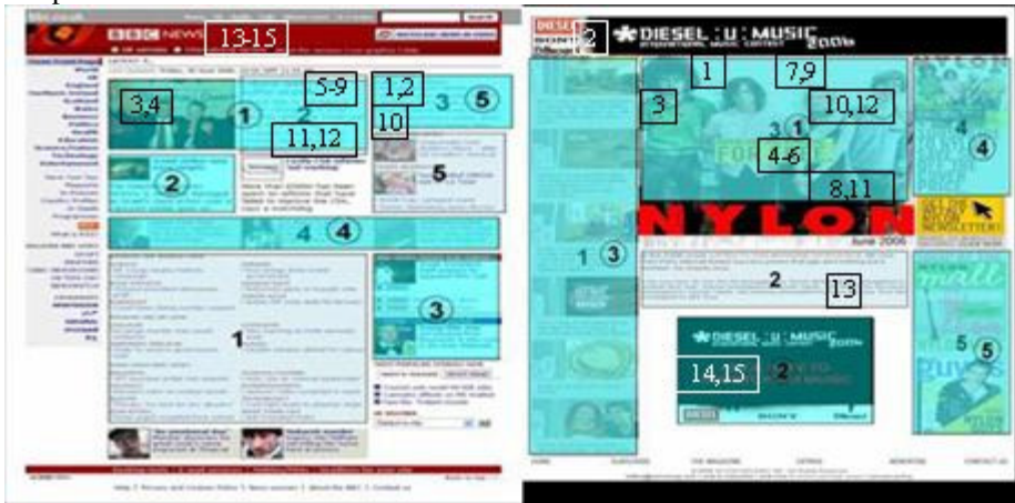
Fig. 3a. User-reported attention to top five areas of interest (number + circle) and top five fixation densities for BBCNews (left) and Nylon (right)

The top five areas measured by fixation densities for each site (indicated by numbers) and the user-reported top five interest areas (numbers in circles) are shown in Figures 3a-c. Overall there was considerable agreement between the fixation densities and subjective ratings of areas of interest, apart from PCWorld and TigerDirect. However, when the top five fixation densities and reported AOIs are used as a measure of salience, in all sites there were 1-2 areas which were reported but not fixated, or fixated but not in the reported top five. The rank ordering for fixation densities and reported AOIs in each site were also different. In the BBCNews site, for example, several users reported the left area story and BBCNews video and newsround stories as interesting, even though they did not fixate on them frequently. Conversely, users fixated on other stories and the around the world section, which were not subsequently rated as interesting. This may reflect a scanning strategy to sample items which are later discarded.