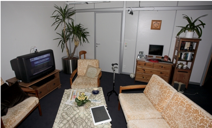
Fig. 3. A view into the living room of the lab

The software application running in the Assisted Living Laboratory is called amiCA 3 . Its goal is to support elderly people so that they can live longer in a self-determined way in their preferred environment. To this end, it monitors the daily behavior of elderly people and assists them to maintain their well-known daily routine (nutrition, movement, sleeping, and other regular activities) as a fellow occupant would do. Of special interest is adequate emergency assistance integrating relatives, health care staff, and emergency medical services. AmiCA will be iteratively evolved into a full-fledged AHCS prototype within the coming years.