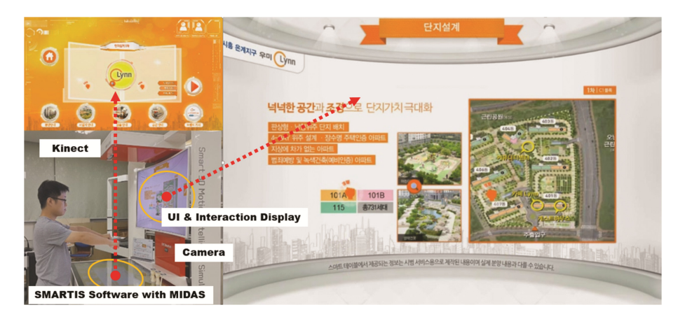
Fig. 4. A scene from interacting with SMARTIS (virtual apartment previewing system) using natural gestures, finger tracking, touch, multiple displays and voice commands.

With SMARTIS, the user can make commands in various ways for making selections (e.g. particular floor plan, apartment model/size, interaction/content modes, view-points), querying for information (e.g. price, location, options), zooming in/out, and navigating and exploring the scene. Many interactions are defined multimodally. For example, the "move forward" command (for navigating the virtual apartment) can be invoked by voice, touch or mid-air gestures separately or combined. Figure 4 shows the system in use and Table 1 summarizes the (multimodal) interfaces for various aforementioned tasks. The output is presented through the two monitors, e.g. the 2D floor plan on the flat monitor and 3D interior scenes on the upright, accompanied by sound/ voice feedback where appropriate. Figure 4 shows the overall system set-up and its typical usage situation.