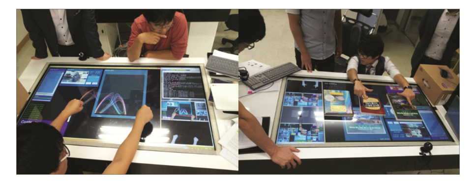
Fig. 5. Another smart table based object manipulation application quickly developed using the same I/O modules and MIDAS-M framework.

The input modules and the core applications in SMARTIS were developed separately on different operating platforms and run on separate computers communicating through the network. The whole system was internally integrated through the event language and protocol of the MIDAS-M, which defined the various input and output events (some of multimodal, see Table 1) and mapped to the core application logic. These event specifications were mostly carried out using the aforementioned authoring tool (Fig. 2).