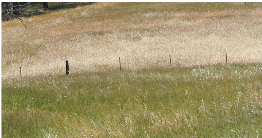
Fig. 4.5 Senesced (background) grasses are naturalized annual species in California's rangelands. Medusa head and goatgrass are present in the foreground, and both are invasive noxious weeds