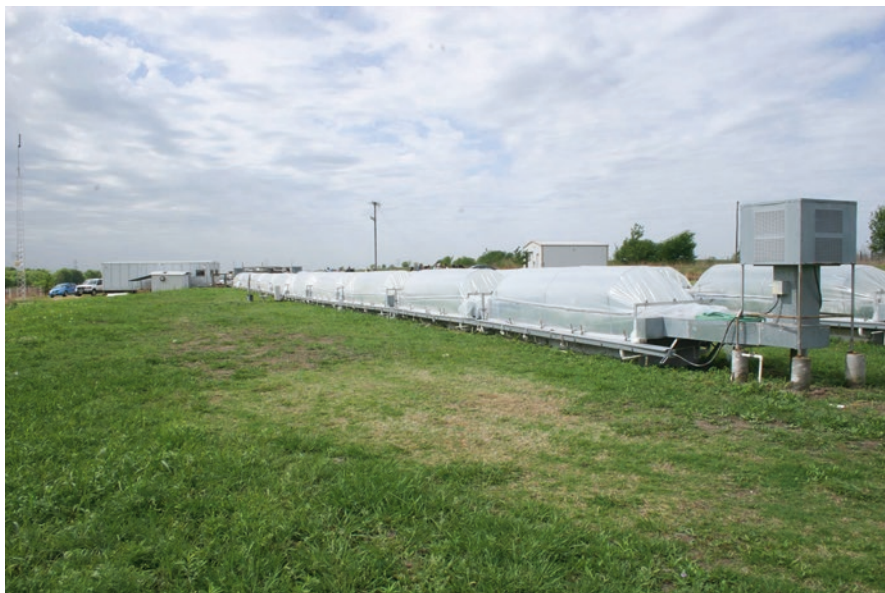
Fig. 4.7 The \text{CO}_2 concentration-gradient study in the tall-grass steppe. Air with an elevated \text{CO}_2 concentration simulating future conditions is introduced at one end and the concentration decreases through photosynthesis as it moves through the tunnel. This allows scientists to examine plant and soil responses ranging from preindustrial to expected levels in 2050 in the same experiment. The experimental infrastructure also allows manipulation of other variables such as soil type