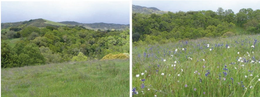
Fig. 4.2 The relative dominance of grasses and broad-leaved species in many rangelands often shifts both temporally and spatially. For example, in this grassland in California the community is grass dominated ( left ) in some years, while in others forbs and legumes are dominant ( right )

Shifts between grass and forb dominance. Rangeland herbaceous vegetation commonly contains both grasses and broad-leaved species (forbs and legumes), with their relative dominance shifting over space and time (Fig. 4.2). Forbs tend to