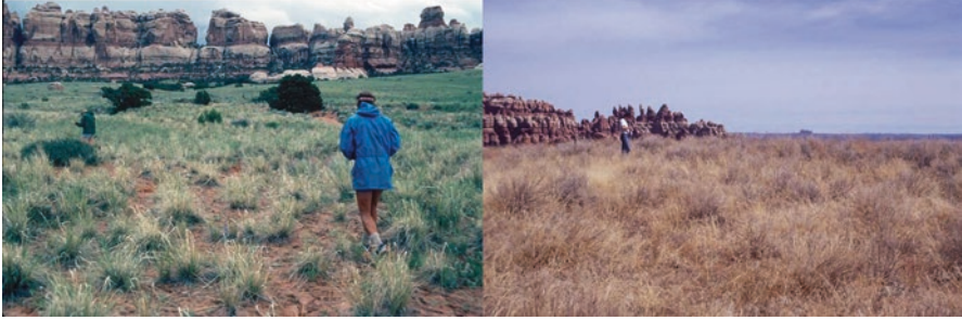
Fig. 4.4 Native (left) and invaded (right) grasslands on the Colorado Plateau. Cheatgrass ( Bromus tectorum ) invasion shades biological soil crusts located in plant interspaces and greatly increases aboveground litter biomass

and Matzner 2009). These wet-dry cycles can also lead to high losses of N through leaching and trace gases, particularly since the wet-dry cycles stimulate N mineralization to a greater extent than C.