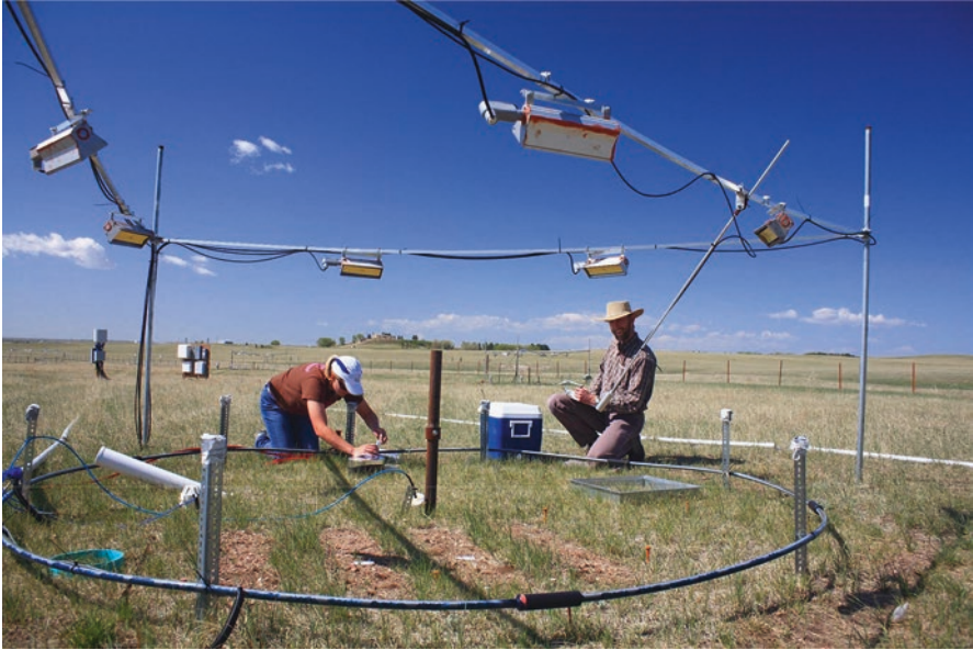
Fig. 4.6 The Prairie Heating and CO 2 Enrichment (PHACE) study located manipulated temperature and CO 2 concentration in C3–C4 shortgrass steppe. Warming was controlled by infrared heaters at the top of each plot, while CO 2 was controlled by emitting gas from the ring at the bottom of the plot