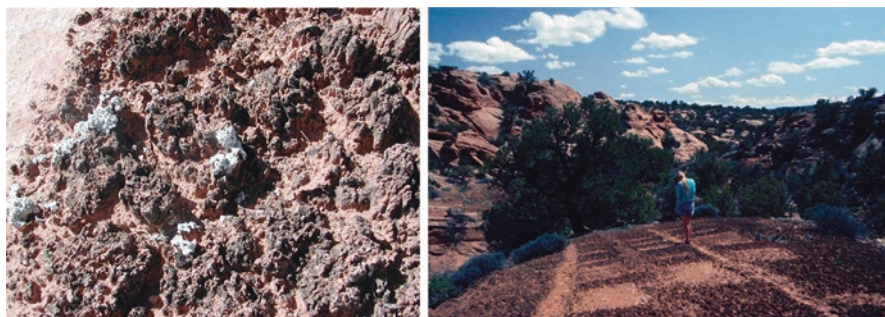
Fig. 4.3 Biological soil crusts are a consolidated matrix of organisms that stabilize soil surfaces ( left ) and can be important components of ecosystem carbon and nitrogen cycles. Coverage can be 100% in plant interspaces. The soil crusts are the dark covering on the soil surface in the photograph on the right ; the light shade is an artificial disturbance treatment illustrating the color of the soil underlying the soil crusts

The impacts of biological soil crusts on surface hydrology and soil stability are complex and variable (Warren et al. 2001; Rodriguez-Caballero et al. 2013). Biological soil crusts decrease erosion by protecting the soil surface from the direct impact of rain drops in a similar manner as vegetation. Greater microtopography of well-developed soil crusts can also increase pooling of water on the crust surface,