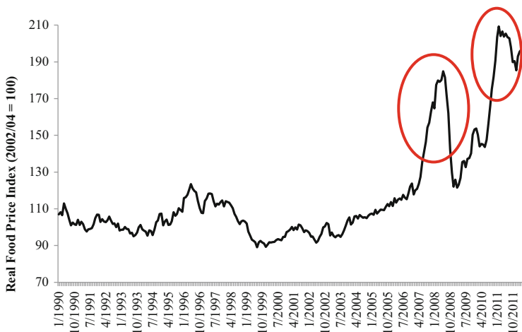
Fig. 19.1 FAO food price index.