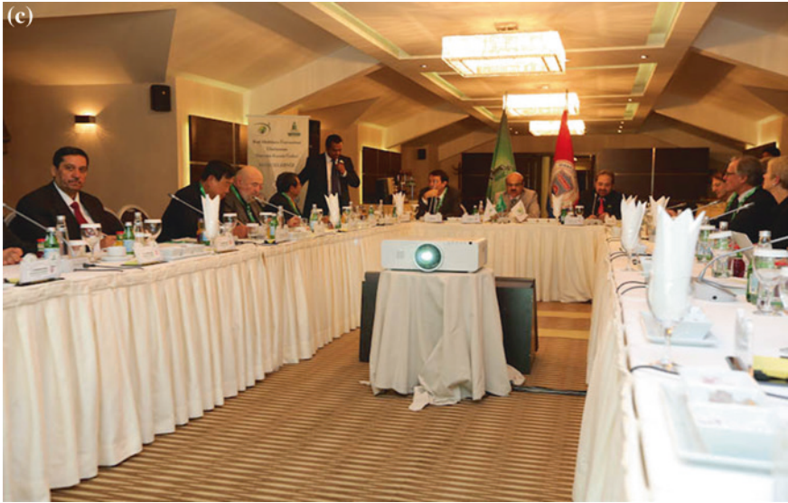
Fig. 4 (continued)