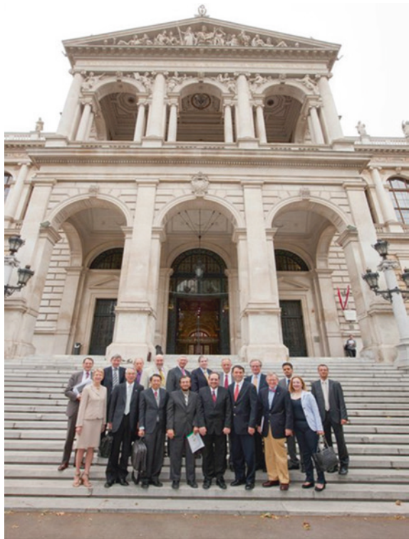
Fig. 2 IAB second meeting at Vienna University, Austria