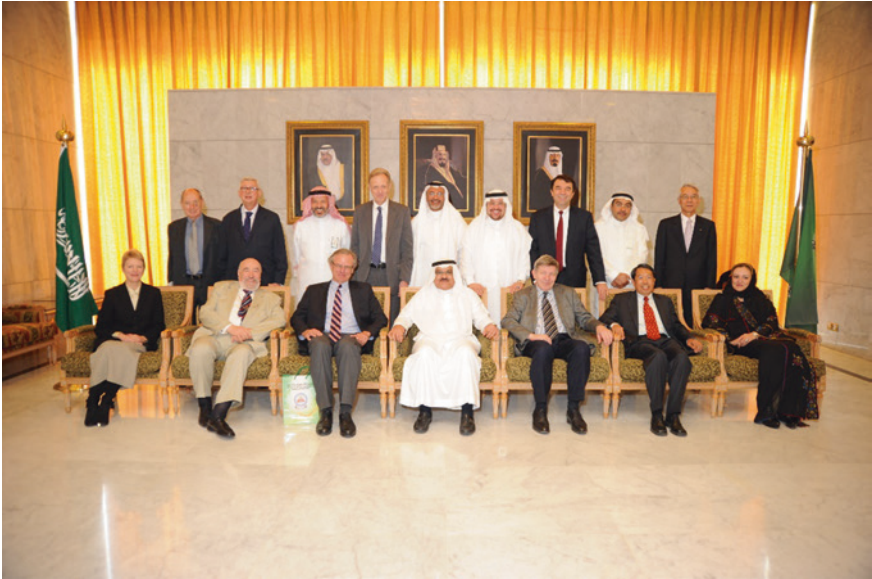
Fig. 1 IAB first meeting at King Abdulaziz University, Jeddah, KSA