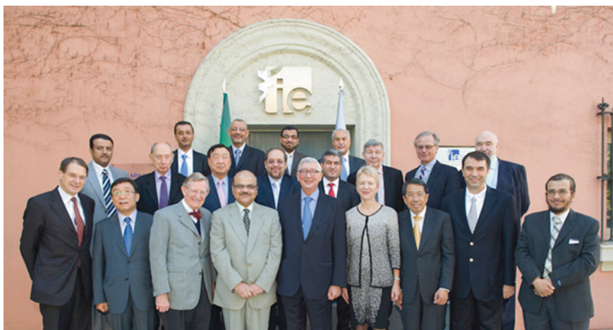
Fig. 3 IAB fourth meeting at IE University, Spain

has a maximum duration of three days. Figure 4a–c show the IAB members during meeting sessions.