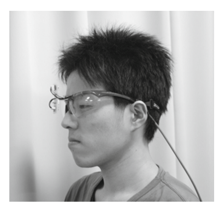
Fig. 3. State of wearing the glasses

In our experiment, five 22-year-old test subjects in good health were tasked with performing mental arithmetic calculations in order to impose an MWL. Specifically, they were asked to solve two-digit numbers addition problems displayed on a PC. They were given three seconds for each problem, after which the next problem appeared, regardless of whether or not their answer was correct. After the test subjects relaxed for a few minutes in a seated position, measurement commenced with three minutes of rest, followed by three minutes of mental arithmetic calculation tasks, and then three minutes of rest, at the end of which measurement was stopped. The total length of the experiment was 9 min.