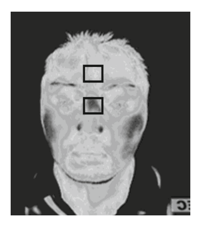
Fig. 1. A facial thermal image of a test subject while under an MWL