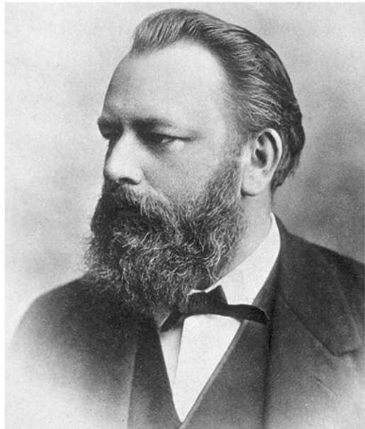
Fig. 10.3 Albert Theodor Billroth, considered by some to be the father of modern abdominal surgery [17]