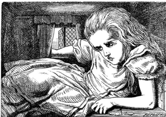
Fig. 10.4 In the “Alice in Wonderland” syndrome, the patient experiences distorted perceptions of body images [29]