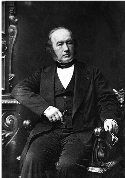
Fig. 10.5 French physiologist Claude Bernard, author of the book Introduction to the Study of Experimental Medicine , 1865 [51]

A century later, in his poem Asphodel, That Greeny Flower , William Carlos Williams wrote [54]: “It is difficult/to get the news from poems/yet men die miserably every day/for lack/of what is found there.” What can we make of this? Williams, I believe, was not saying that a lack of what is found in poetry causes men to die , but rather that their deaths are sometimes unnecessarily miserable for want of the imagery, joy, and even the cadence of poems. And perhaps also, by inference, a paucity of philosophical reflection. In my opinion, he was writing about the quality of life at the time of dying, and how it can be enhanced by metaphor, simile, allusion, and nuance of language and thought.