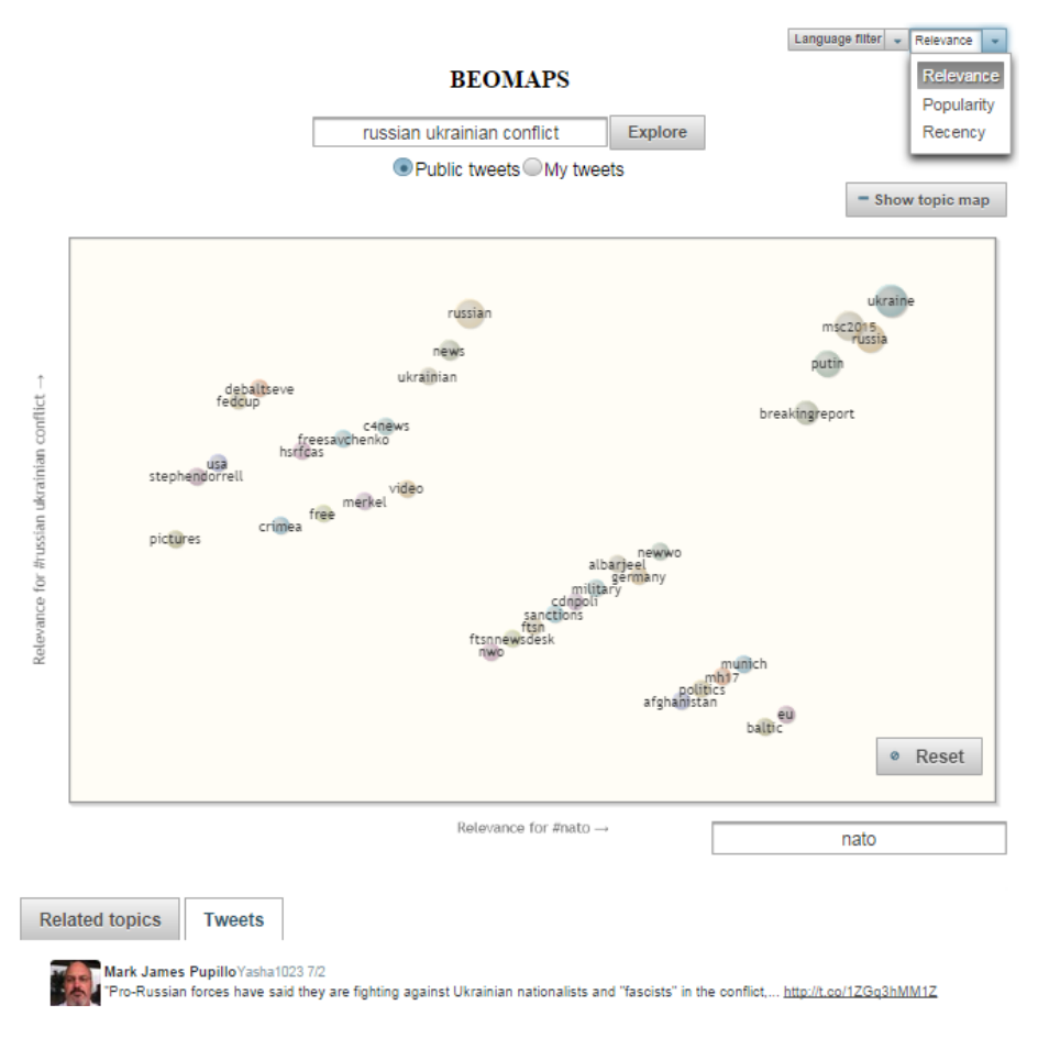
Fig. 1. Beomap is a two-dimensional topic map which supports ad hoc semantic dimensions that can be easily defined through a second query e.g. Nato. Further, it allows one to visualize a topic map with respect to the user defined meta-data metric e.g., Relevance. The topics in the top right corner are relevant for the main query as well as for the ad hoc dimension.

data. The underlying information landscape is adapted to user information need using Belief propagation algorithm. Users rated the system positively when used for sensemaking while browsing a scientific literature network. This work is in line with our motivation, to support user-driven exploration of the information landscape. The user-driven exploration in Beomap is achieved through a second ad hoc query dimension that allows users to regenerate freely a topic map according to user information need. The consequences of our design are a more realistic understanding of the underlying information landscape and the possibility of observing topic correlations between the main and second ad hoc query. Although, the adaptation is not the scope of this study, our system could be