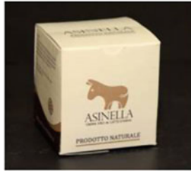
Glossy embossed with texture