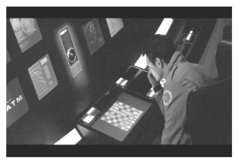
Fig. 5. A scene from "2001: A Space Odyssey" (1968) by Kubrick, S.

But "2001 a space odyssey" by Kubrick, S. (1968) described seemingly scientific spaceship and computer robot "HAL". But the lamps, buttons and levers on the operation console only seemed to be scientific and do not seem to be valid.