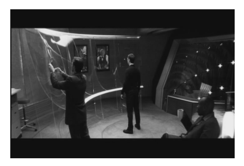
Fig. 6. A Scene from "Minority Report" (2002) by Spielberg, S.

In this century, SciFi movies such as "Minority report" (2002) by Spielberg, S. described a detailed interactive operation of the system that might have been influenced by the development of non-verbal interface and other research trends in HCI. Although the interface of the system does not seem to be the one that could be realized by the current technology and the usability of the system seemed to be not good, the scientific description has advanced so much compared to previous SciFi movies.