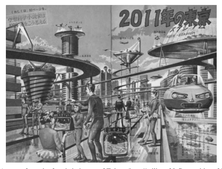
Fig. 12. A scene from the futuristic image of Tokyo (http://military38.Comarchives 28071211. html)