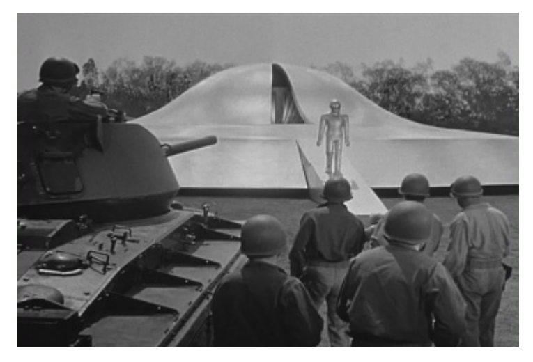
Fig. 4. A scene from "The Day the Earth Stood Still" (1951) by Wise, R.

Even in 1950s, "The day the earth stood still" by Wise, R. described some magical and mysterious alien and its robot with no scientific validity.