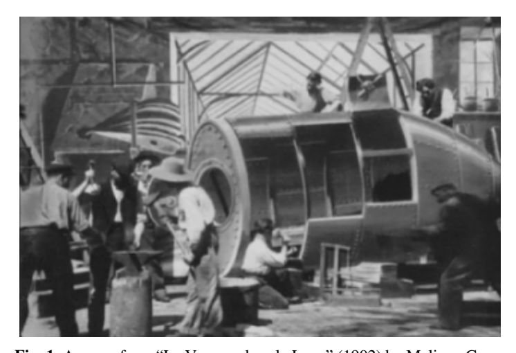
Fig. 1. A scene from "Le Voyage dans la Lune" (1902) by Meliers, G.

Early SciFi movies such as "Le Voyage dans la Lune" by Meliers, G. (1902) contained many futuristic but unrealistic ideas on artifacts including the rocket launched by a canon, the rocket with only the cabin inside it, the rocket without any shock absorber for landing, and so many other strange ideas.