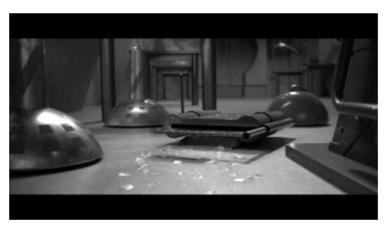
Fig. 7. A Scene from "Fifth Element" (1997) by Besson, L.

There are some descriptions of the future UI that could successfully predict the future of products and systems. One example is the image of sweeping robots described in Luc Besson's "Fifth Element" (1997). When a glass fell on the floor and is broken, two types of round robot appeared and started sweeping the glass on the floor.