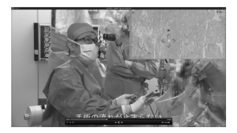
Fig. 10. A scene of operation at the hospital using Kenect