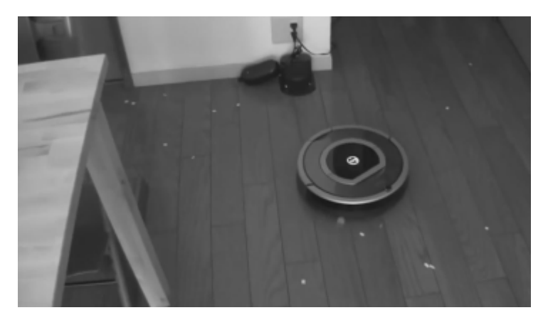
Fig. 8. A view of Roomba working on the floor

The image and the movement of the sweeping robot are quite similar to those of "Roomba" of which "Roomba 500 series" first appeared in the market in 2007. The difference of the robot sweeper in the movie and "Roomba" are 1). The robot sweeper detects the location of the clashed glass and goes directly to the target, and 2) "Roomba" does not include the broom-type and cannot collect large fragments of the glass. It is not clear if "Roomba" was developed by being inspired by the movie. But the movie made a correct prediction regarding the idea of automatic sweeping robot.