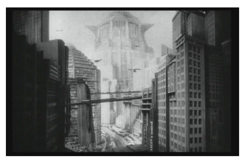
Fig. 11. A scene from "Metropolis" (1927) by Lang, F.

On the other hand, there are so many unrealistic predictive images on the future UI in SciFi movies. One example is the image of the future traffic system.