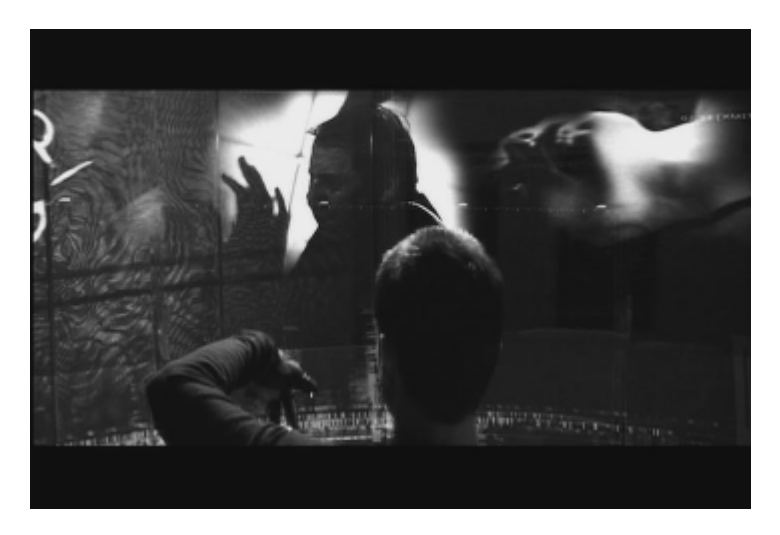
Fig. 9. A scene from "Minority Report" (2002) by Spielberg, S.

Another example is the gesture manipulation of visual images in "Minority Report". Although the necessity of the bodily manipulation is not clear in the movie and one can think of the mouse or hand operation on the wide screen as an alternative, the application of "Kinect" by Microsoft at the scene of surgery in the hospital is quite reasonable. During the operation, doctors have a need of viewing the relevant X-ray and other visual images when necessary. But, for the purpose of controlling the possible contamination, physical operations by using the pointing device is not desirable. In this situation, the gesture manipulation of visual image is quite meaningful.