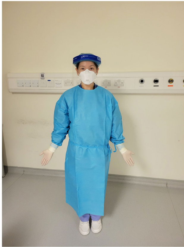
Fig. 1 Full gear of personal protection equipment (including hair net, face shield/goggles, N95 respirators or equivalent, water)