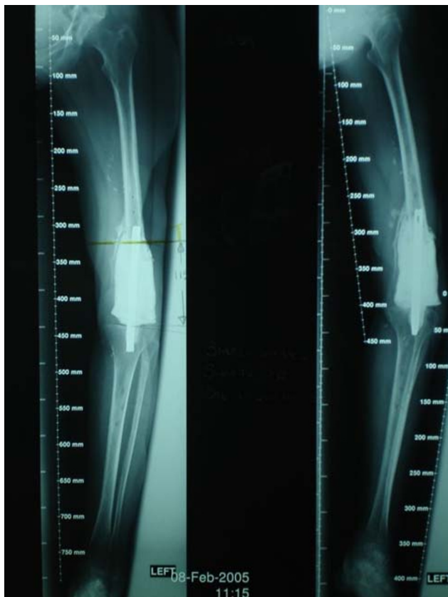
Fig. 3 Long leg radiographs for preoperative planning for the endoprosthetic replacement

The patient is now 3 years from the endoprosthetic reconstruction. She is independently mobile and able to drive a car without limitations. The knee flexion remained limited to 0°–30° only. There is no evidence of infection.