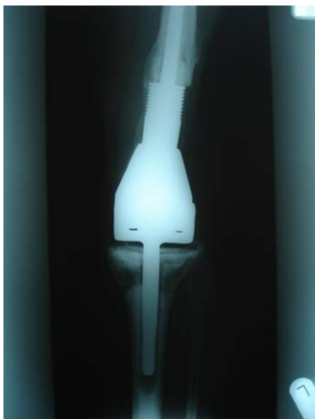
Fig. 5 Plain radiograph of the endoprosthetic replacement at 3 years follow-up

used in the MESS system. Helfet et al. [4] have reported that an MESS score of greater than or equal to 7 had a 100% predictable value for amputation.