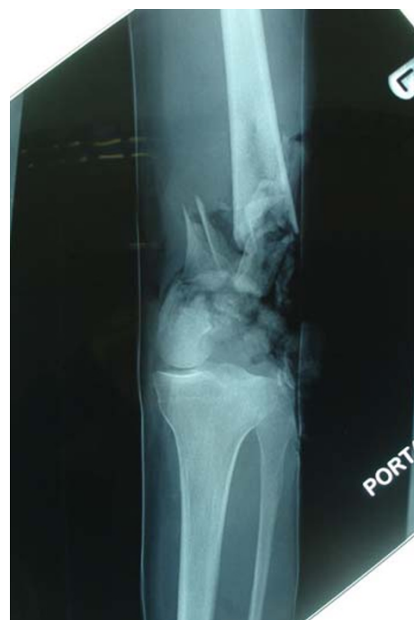
Fig. 2 Plain radiograph confirming a comminuted distal end fracture of left femur with bone loss

The aim was to reconstruct these defects using an endoprosthesis replacement. Option of an amputation and limb preservation was discussed with the patient. The patient preferred limb salvage. The plastic surgeon was also involved in the decision-making process and the patient was informed of the treatment plan. Over the next few days, a relook debridement was done and was followed by repeat debridement. The vascular status of the limb was normal, but there was a foot drop on clinical assessment. The wound exploration revealed that the common peroneal nerve was found to be intact, but had been stretched. A cement spacer to allow for the bone loss and a lateral gastrocnemius flap were harvested with input from the plastic surgeons. Unfortunately, this got infected with bacillus species. The wound was debrided, an across knee intramedullary rod and cement spacer was used to achieve stability. The infection was controlled by intravenous vancomycin.