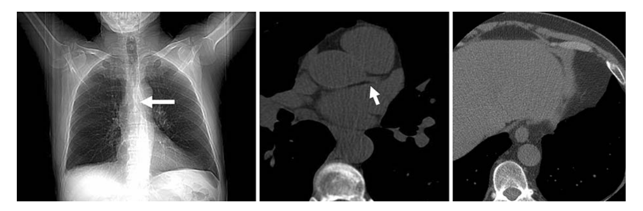
Fig. 1 A scout film ( left panel ) used to identify the upper and the lower limits of the region of interest for the subsequent CTA. The white arrow shows the level of the carina, which is a landmark for determining the top of the coronary tree. Middle panel An axial slice of a non-contrast coronary calcium scan showing the left main artery ( black arrow ). The exact level in which the superior most coronary arteries arise is most

Using the scout image, the field of view usually extends from \sim 1 cm below the carina to just below the diaphragm to ensure complete coronary imaging (Fig. 1). The scout film is highly inaccurate for determining the precise origin of the coronary arteries [12]. An alternative is to use images from the coronary calcium scoring to set the upper limit above the apex of the left anterior descending artery (the most superior artery) and the lower limit inferior to the posterior descending artery, leaving sufficient but not excessive margins, to allow for movement. Calcium scoring with MDCT delivers \sim 1.2 mSv when acquired with prospective ECG gating, and potentially lower if 100 kVp is used for this acquisition [4]. A