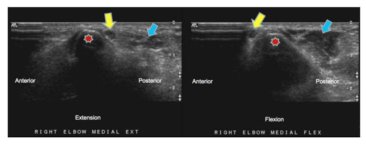
Fig. 3 Ulnar nerve dislocation associated with a low-lying medial triceps muscle: 31-year-old male with clinical symptoms of snapping sensation in the right elbow with flexion and ulnar-sided paresthesias in the hand. Transaxial dynamic ultrasound of the cubital tunnel at the

can differentiate isolated ulnar nerve dislocation from snapping triceps syndrome [1]. In isolated ulnar nerve dislocation, the ulnar nerve will dislocate anterior to the medial epicondyle with elbow flexion and the medial triceps muscle will remain posterior to the medial epicondyle. In contrast, in snapping triceps syndrome, both the ulnar nerve and the medial triceps muscle will dislocate anterior to the medial epicondyle (Fig. 3) [1]. The abnormal nerve will also demonstrate thickening and loss